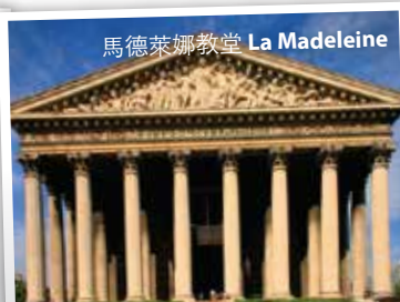
馬德萊娜教堂 La Madeleine

前往巴黎觀賞各大名：[巴黎聖母院]、[羅浮宮]、[馬德萊娜教堂]、[凱旋門]和[埃菲爾鐵塔]等，登上[蒙帕納斯大樓56層觀景廊]及[乘觀光船漫遊塞納河兩岸]。Drive to Paris. Visit Notre Dame Cathedral , Louvre , La Madeleine , Arc De Triomphe , Eiffel Tower etc. Visit the world-famous 56 floored Montparnasse Tower .