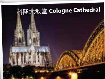
科隆大教堂 Cologne Cathedral

在阿姆斯特丹參觀[新士堅斯風車村]，村內保留著數座像徵荷蘭標誌的風車，更安排參觀荷蘭[傳統木屐廠]及[芝士廠]，觀賞其製造過程。之後前往[鑽石中心]參觀鑽石打磨法和精巧細緻的製造過程。然後[乘玻璃船暢遊荷蘭運河]。Visit a cheese farm and clog maker's house . Cross Dam Square and pass the Royal Palace to see diamonds being cut and polished. Then take a canal cruise .