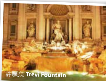
許願泉 Trevi Fountain

Then drive south to Pisa and view the Square of Miracles and the famous Leaning Tower . In the Renaissance city of Florence, enjoy spectacular views of the city from Piazzale Michelangelo. Afterwards there is time to explore the Piazza Signoria , the Duomo , Giotto's Bell Tower and Ponte Vecchio .