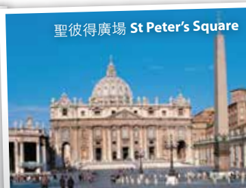
聖彼得廣場 St Peter's Square