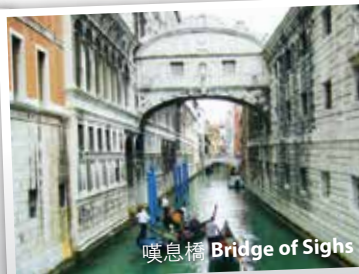
嘆息橋 Bridge of Sighs