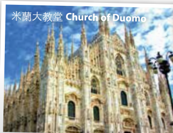
米蘭大教堂 Church of Duomo

Admire the sights of Milan during your morning short orientation tour, including La Scala and Church of Duomo .