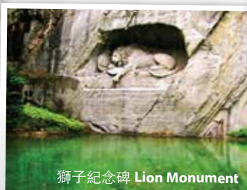
獅子紀念碑 Lion Monument

In the afternoon visit Mount Titlis in Swiss Alps. Then drive to the picturesque lakeside town of Lucerne. A short orientation tour includes Lucerne's emotive Lion Monument and the covered Chapel Bridge . You will also have time to shop for Swiss specialties.