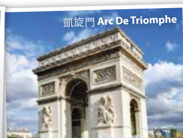
凱旋門 Arc De Triomphe

全天遊覽巴黎市區，包括[協和廣場]、[香榭麗舍大道]、[歌劇院]和於[著名購物名店街]瘋狂購物。