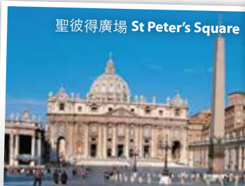
聖彼得廣場 St Peter's Square

前往天主聖地教皇國、世界小的獨立國-梵蒂岡觀光，參觀幾百年的積累財富和迷人的[西斯廷教堂]。之後參觀世界上最大的[聖彼得大教堂]和宏偉的[聖彼得廣場]。然後渡河到意大利首都、世界著名的歷史文化名城-羅馬，遊覽羅馬古蹟中最著名的[羅馬鬥獸場]、[許願泉]和[西班牙階梯]。Begin today's sightseeing at the World's smallest state, the Vatican City . See the centuries of accumulated wealth and the breathtaking Sistine Chapel. Enter St Peter's Basilica , the largest church in the world and emerge into St Peter's Square . Then cross the River Tiber into ancient Rome to the Forum and the mighty Colosseum . Visit the incredible Trevi Fountain and Spanish Steps .