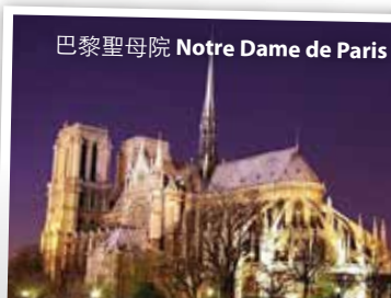
巴黎聖母院 Notre Dame de Paris

前往巴黎觀賞各大名：[巴黎聖母院]、[羅浮宮]、[馬德萊娜教堂]、[凱旋門]和[埃菲爾鐵塔]等，登上[蒙帕納斯大樓56層觀景廊]及[乘觀光船漫遊塞納河兩岸]。Drive to Paris. Visit Notre Dame Cathedral , Louvre , La Madeleine , Arc De Triomphe , Eiffel Tower etc. Visit the world-famous 56 floored Montparnasse Tower .