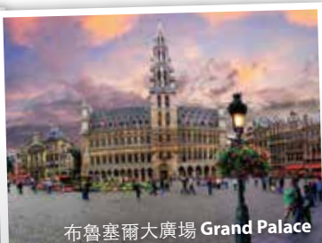
布魯塞爾大廣場 Grand Palace

前往比利時首都-布魯塞爾，那裡有著濃郁的文化藝術氛圍。參觀[布魯塞爾大廣場]和[撒尿小童像]。Drive to Brussels and visit the Grand Palace and cheeky Mannekin Pis statue .