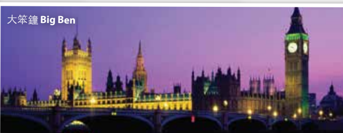
大笨鐘 Big Ben

Welcome to London, the 2012 Olympic City! Enjoy a full day London sightseeing including Big Ben , Trafalgar Square , Buckingham Palace , Westminster Abbey , St Paul Cathedral , Tower Bridge , China Town , Piccadilly Circle , Parliament House etc.