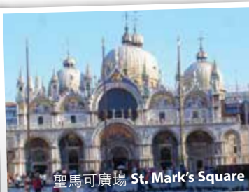
聖馬可廣場 St. Mark's Square